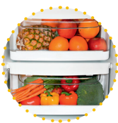
crisper bin (= crisper drawer)