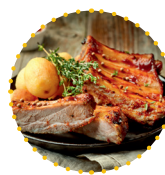
ribs and roast (= ed potatoes)